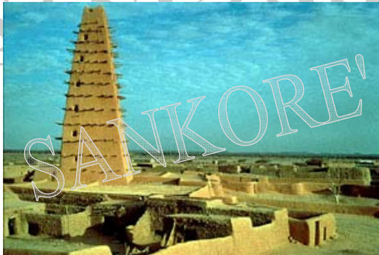
Masjid of Shehu Uthman Dan Fuduye' in Agadez, Niger in the lands of Ahir

The religion of Islam spread in this region extensively and the baraka appeared among its people and much good. There are among them many scholars and awliyya , so numerous, that only Allah knows their true number. However, their biographies have been lost because of the lack of written history in these lands, as mentioned previously. But we will cite a beam as evidence of this.